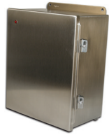
Logic Controller/ Power Supply

The WDE EasyKits provide a secure outdoor system with 15-second delay and 100dB alarm when someone attempts to exit. The WDE EasyKit is perfect for garden center gates, amusement parks, sports arenas and any location exposed to weather or moisture where delayed exit is required. Although ideal in helping prevent theft, in applications such as outdoor childcare and assisted living homes, WDE EasyKit can also be used to help protect those trying to exit.