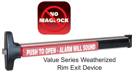
Value Series Weatherized Rim Exit Device