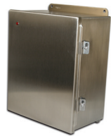
Logic Controller/ Power Supply

The WDE EasyKits provide a secure outdoor system with 15-second delay and 100dB alarm when someone attempts to exit. The WDE EasyKit is perfect for garden center gates, amusement parks, sports arenas and any location exposed to weather or moisture where delayed exit is required. Although ideal in helping prevent theft, in applications such as outdoor childcare and assisted living homes, WDE EasyKit can also be used to help protect those trying to exit.