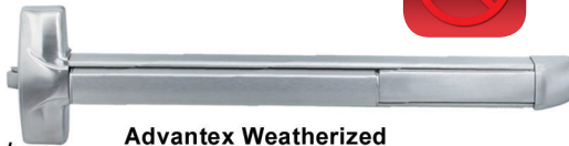
Advantex Weatherized Rim Exit Device