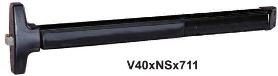
V40xNSx711 (711 Finish)