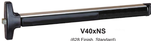
V40xNS (628 Finish, Standard)

The V40xNS Series narrow stile rim exit device is secure and durable panic and fire exit hardware at an economical price. It is designed for use on narrow stile single and double doors with mullions. The patented mounting plate and strike locator system ensures the easiest and most accurate installation of panic hardware available. Extended length enables V40xNS to span stiles on 2" narrow stile doors.