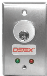
CS-432, CS-442, CS-452 and CS-462 (2 LEDs - red and green) Shown with Cylinder (Cylinder sold separately)

The CS-400 series Keyswitches are designed as control devices for use with Access Control Systems, Delayed Egress, Electric Dogging and Exit Alarms. Other products that require remote input may also use one of these switches. The 430 and 450 models use momentary switches; the 440 and 460 models use maintained switches.