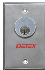
CS-430, CS-440, CS-450 and CS-460 (No LED) Shown with Cylinder (Cylinder sold separately)