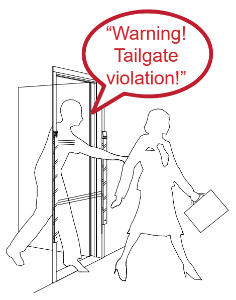
Local digital voice annunciator