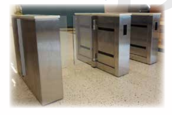
Invisigate™ ES880 Glass Barrier Optical Turnstile

Designed for use in building lobby applications where higher security, high speed throughput and interior aesthetics are priorities. The Optical Turnstiles with Glass Barriers provide a visual as well as physical barrier which communicates to pedestrians that authorization is required before entering the secured area. The glass barriers can be configured for panels as high as 6'0" which provide a full height lockable barrier. These units will monitor high throughput pedestrian traffic flow of up to 60 people per minute per lane. The glass panels open in less than 1.5 second.