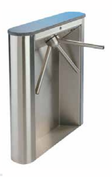
Waist High Turnstiles

Our waist high turnstiles and ADA gates can be found across the globe at top pro sports venues, embassies, universities and retail sites. From basic carbon steel tripod turnstiles to sophisticated stainless steel waist high turnstiles with wood laminate tops, we have a solution for all your needs. We offer portable turnstiles that can count (for convention centers and state fairs), coin and bill acceptor turnstiles for venues and border areas and, ticket storage turnstiles. We also offer matching waist high ADA gates to complete any turnstile installation.