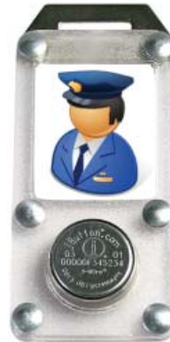
ID Badge (REL-BDG)

iButton ID Badges and Keys are used to identify officers or supervisors in the reports, so that responsibility for performance of tasks may be assigned.