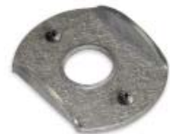
Aluminum Mount (REL-CKP-MNT3)