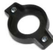
ABS Mount (REL-CKP-MNT2)

Other options for mounting iButtons include one-piece mounts in ABS plastic or aluminum.