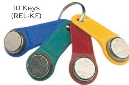
ID Keys (REL-KF)