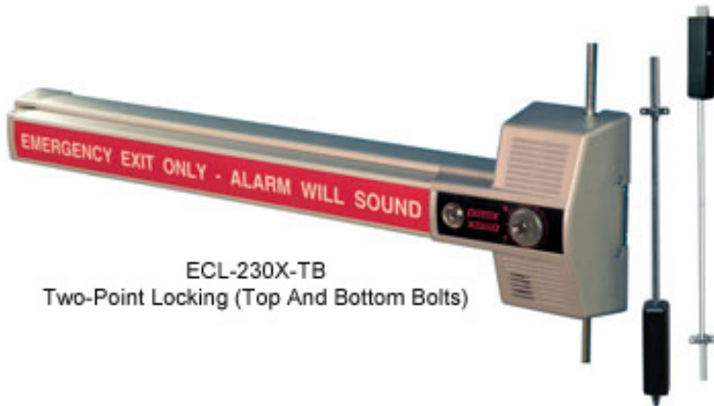
ECL-230X-TB Two-Point Locking (Top And Bottom Bolts)